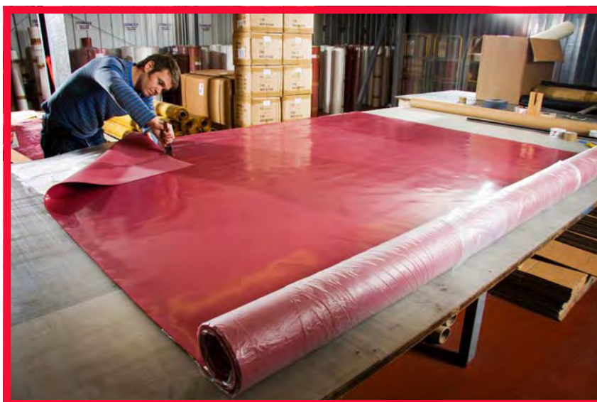
The photograph above shows part of a major contract undergoing final inspection at J-Flex.

The shipment shown here was valued at £40,000 (€42,000) and forms part of a projected annual contract of £300,000 (€315,000).