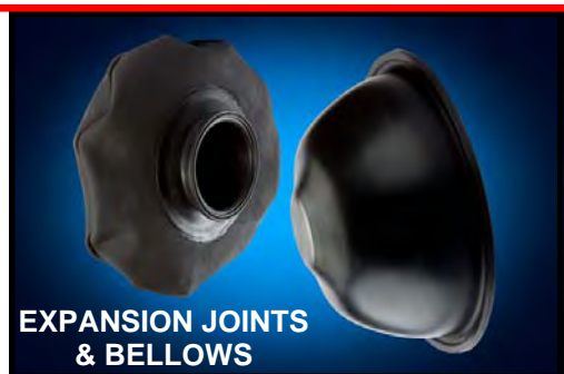
EXPANSION JOINTS & BELLOWS