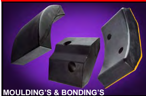
MOULDING'S & BONDING'S

In 2010 we've got products for you that seal, insulate, protect & repair